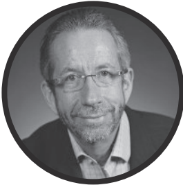
JENS NYMAND CHRISTENSEN

Minister for Education, Culture and Science The Netherlands