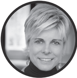
H.R.H. PRINCESS LAURENTIEN OF THE NETHERLANDS

Policy Officer in Basic Skills DG EAC (European Commission) Belgium